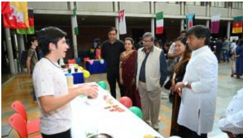
One of the many stalls at the International Food Festival at UPES Dehradun

UPES hosts over 60 exchange students from 27 different countries and the event was organised to celebrate the cultural diversity on campus and help foster unity through the medium of food